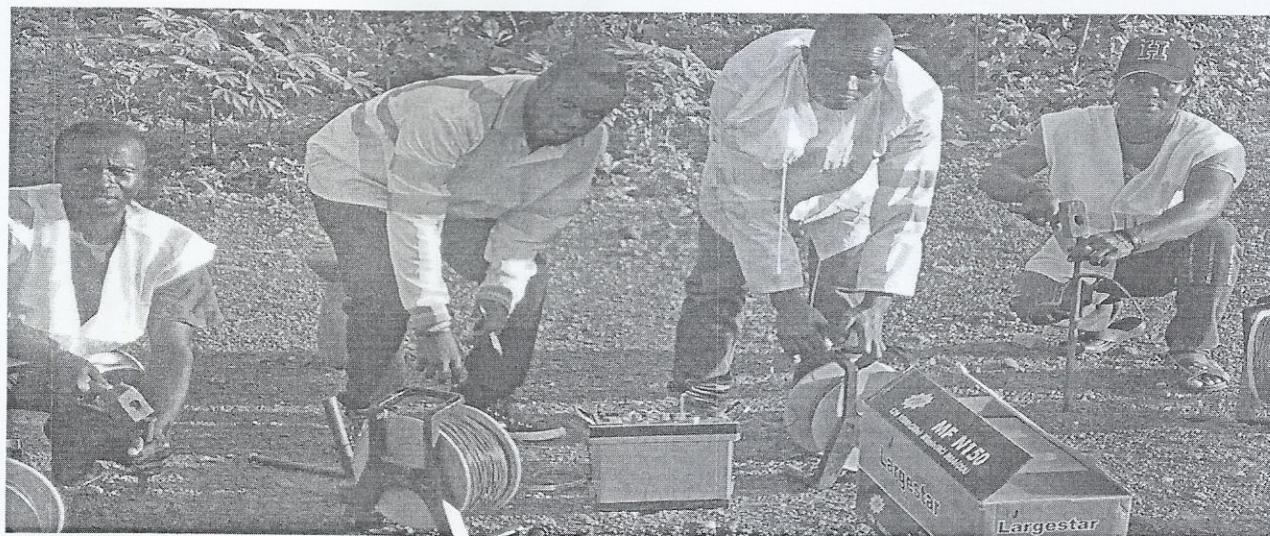
Photo showing Geophysical team at work